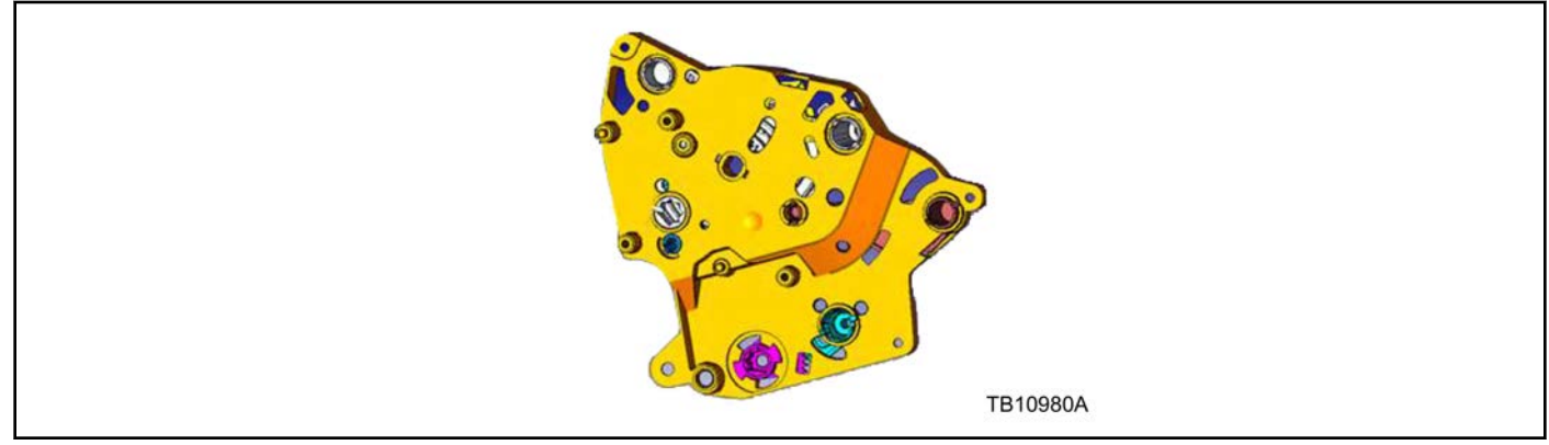
Figure 1 - Article 17-0027

5. Use a screwdriver or similar tool to manually cycle the mode door mechanism. Does the panel door bind when manually cycled? (Figure 2)