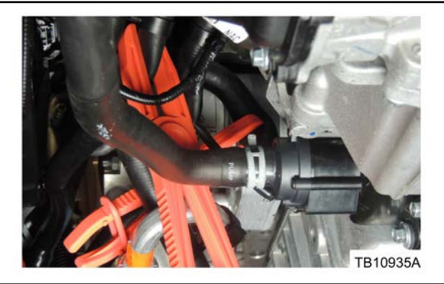
Figure 1 - Article 16-0150

NOTE: The information contained in Technical Service Bulletins is intended for use by trained, professional technicians with the knowledge, tools, and equipment to do the job properly and safely. It informs these technicians of conditions that may occur on some vehicles, or provides information that could assist in proper vehicle service. The procedures should not be performed by "do-it-yourselfers". Do not assume that a condition described affects your car or truck. Contact a Ford, Lincoln, or Mercury dealership to determine whether the bulletin applies to your vehicle. Warranty Policy and Extended Service Plan documentation determine Warranty and/or Extended Service Plan coverage unless stated otherwise in the TSB article. The information in this Technical Service Bulletin (TSB) was current at the time of printing. Ford Motor Company reserves the right to supercede this information with updates. The most recent information is available through Ford Motor Company's on-line technical resources.