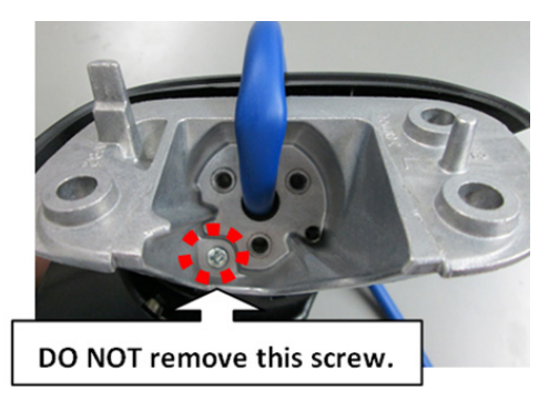
IMPORTANT: Avoid damaging the Phillips drive portion of the screws by using No. 2 size Phillips screw driver. They are installed with a thread locking compound and may require some extra force to remove.