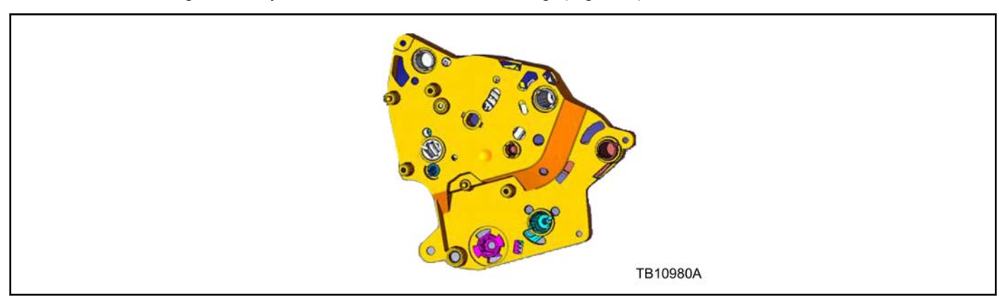
Figure 1 - Article 16-0158

5. Use a screwdriver or similar tool to manually cycle the mode door mechanism. Does the panel door bind when manually cycled? (Figure 2)