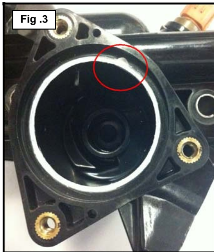
Alignment Tab on Thermostat Housing

To prevent any further repeat repairs, follow the procedure outlined on KGIS and remove all necessary components to gain proper access, including the air box assembly . Correctly position the thermostat in the housing by aligning the tab on the thermostat housing (Fig. 3) with the tab on the thermostat body (Fig. 4). Try rotating the thermostat to validate if it is properly indexed and seated. No movement should be possible, if properly installed. Make sure the thermostat does not move during installation of the housing as this could cause repeat repairs.