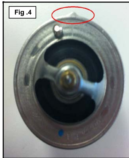
Alignment Tab on Thermostat