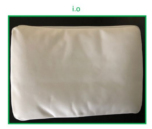
Figure 2, OK condition