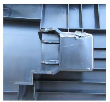
Enlarged View of Damaged Claw