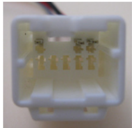
View from front of connector