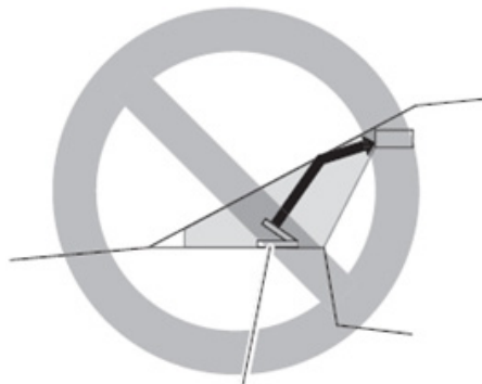
Monitor or other accessories