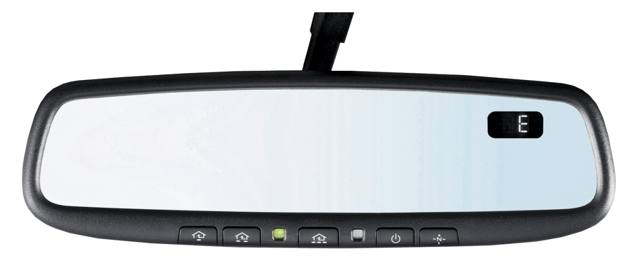
Auto-Dimming Compass Mirror with HomeLink

For mirror installation, remove the OE mirror by first disconnecting the wire harness from the back of the mirror. Loosen the Torx® screw then slide the mirror upward and off of the windshield mirror mount.