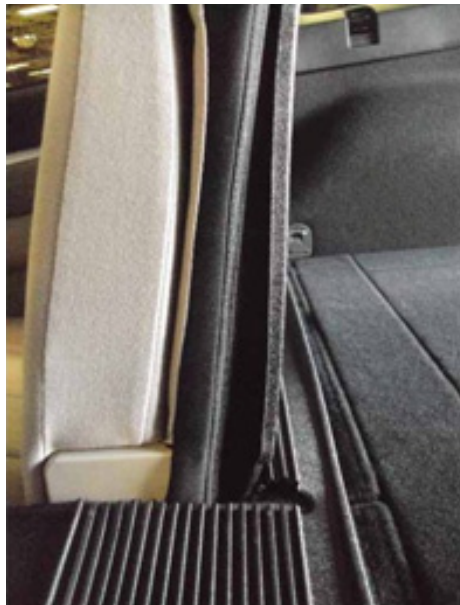
Typical seat back protector fit

If the seat back protector buckles outward from the rear seat back excessively, please make sure the seat back protector is installed properly. A seat back protector that is installed too low on the rear seat back will interfere with a bracket in between the cargo area floor and the rear seats. This interference causes the seat back protector to buckle when the seats are folded upright.