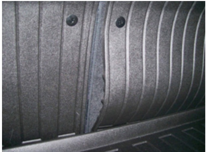
Poor appearance of seat back protector due to improper installation