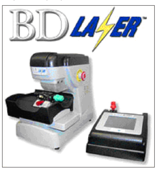
High Security Keys