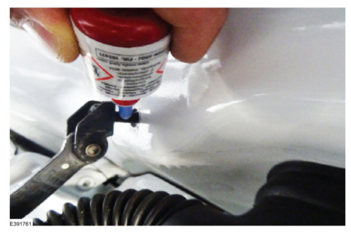
3. Apply 2-3 drops of Motorcraft® Threadlock 262 to the fastener. (Figure 3-4) Figure 3