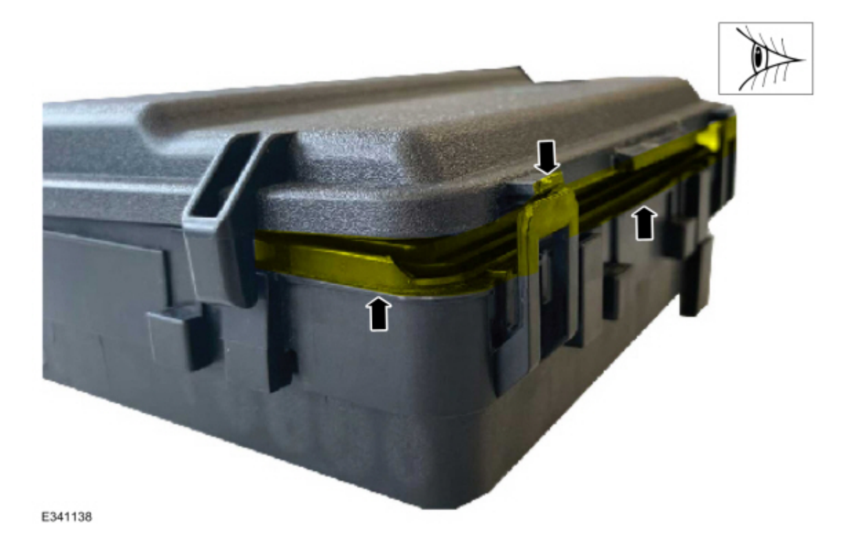
Figure 6 - Incorrect cover installation