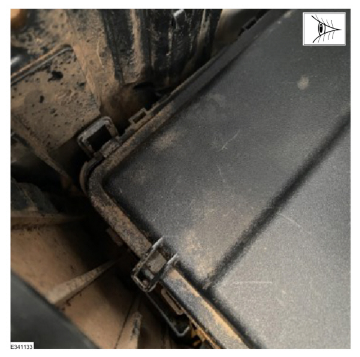
Figure 2 - Example of moisture intrusion with BJB cover off

(2). No - this article does not apply. Refer to Workshop Manual (WSM) for symptom based diagnostics. Figure 1 - Example of moisture intrusion with BJB cover on