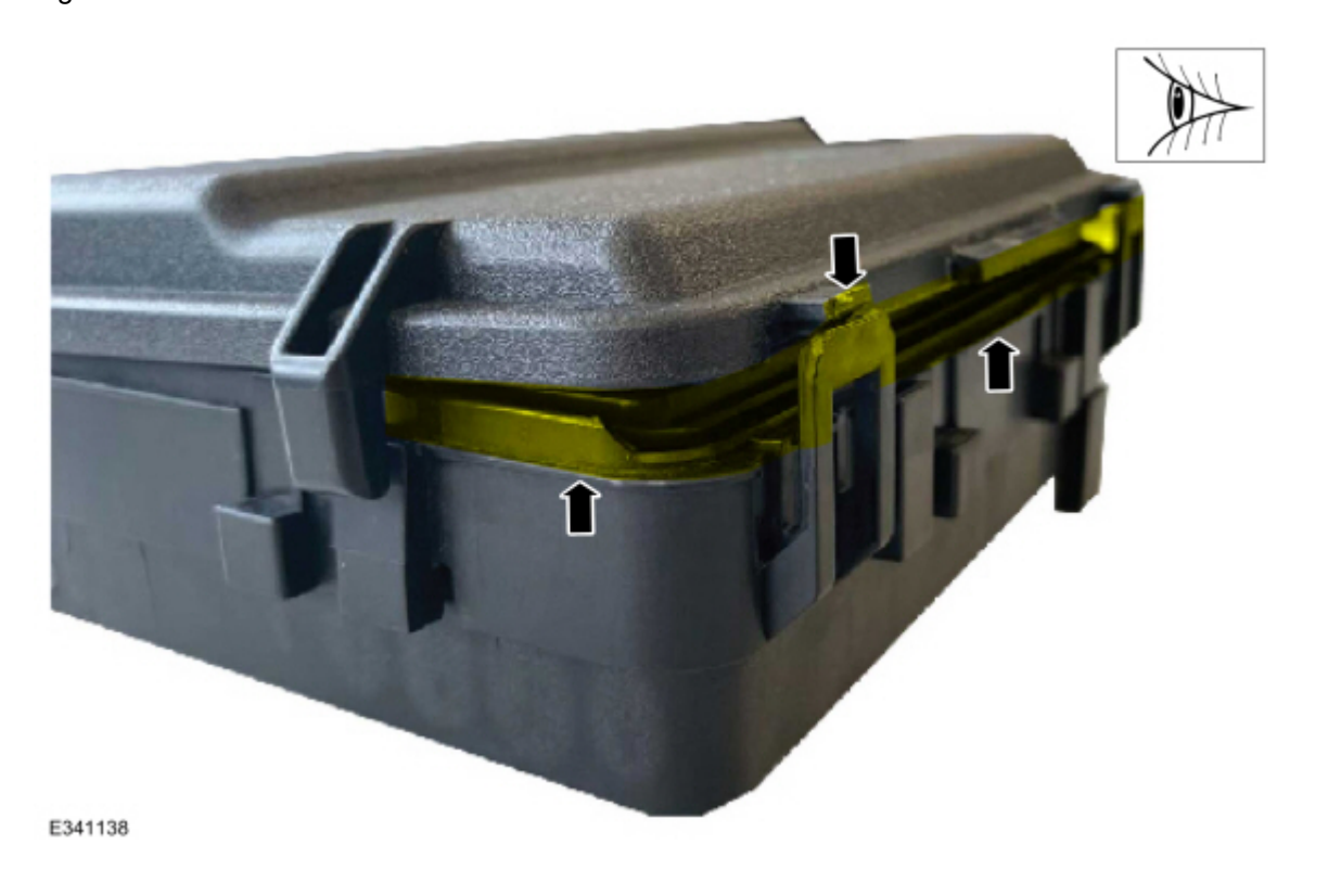
Figure 6 - Incorrect cover installation