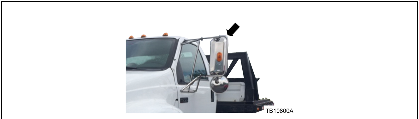
Figure 1 - Article 15-0164