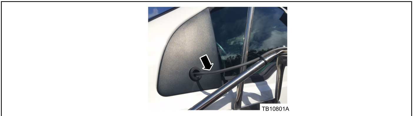
Figure 2 - Article 15-0164