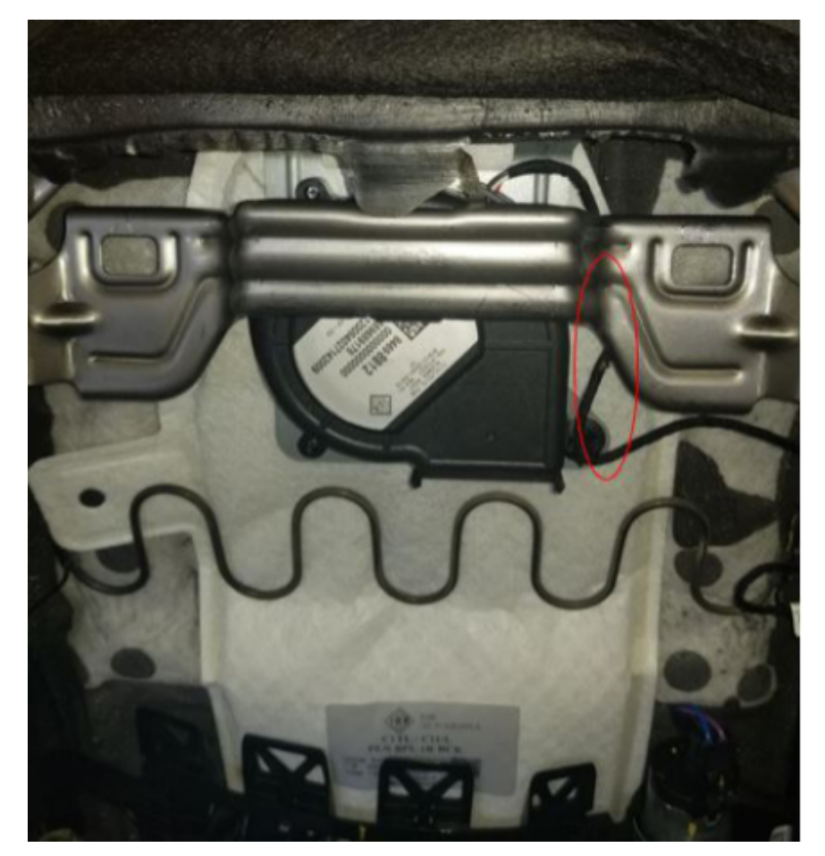
The harness may need to be moved to see the area that is damaged.