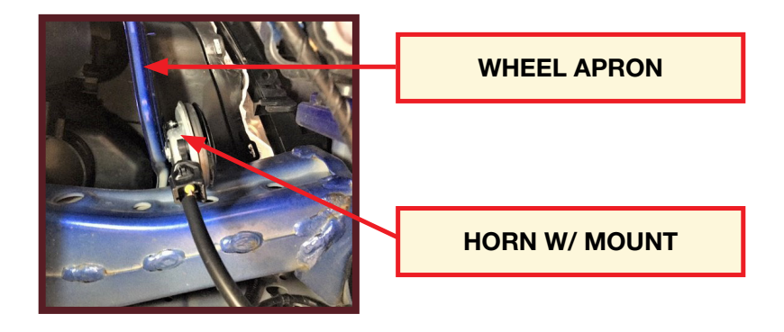
STEP 2) Slightly reposition the left horn mount towards the front of the vehicle. Use CAUTION not to apply excessive force causing damage to the mount. Function test the horn to in after adjustments to confirm there is no rattle/vibration sound during operation.