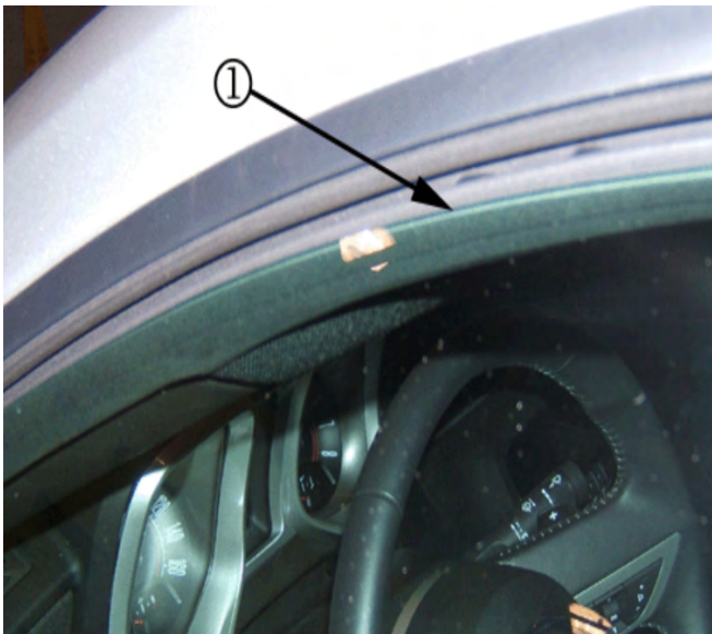
Window in "Indexed" Position (1) (When Door Latch is Opened)