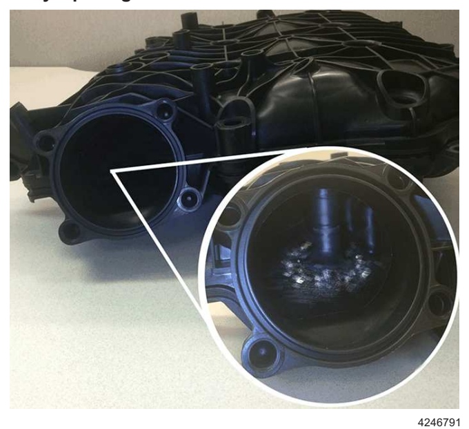
View of Debris in Plastic Intake Manifold – Throttle Body Opening