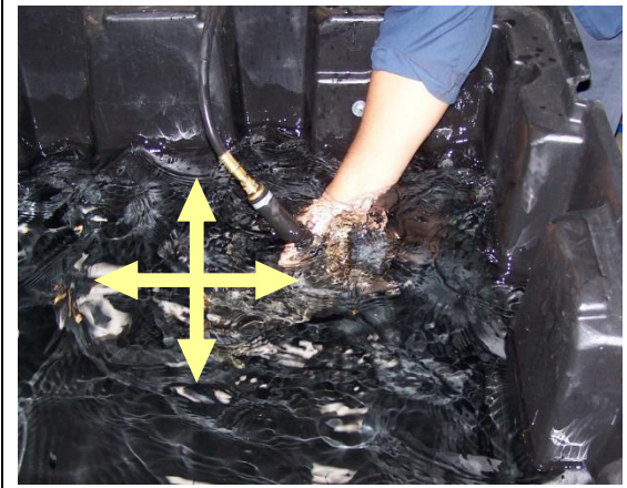
Shake Cooler to release trapped air