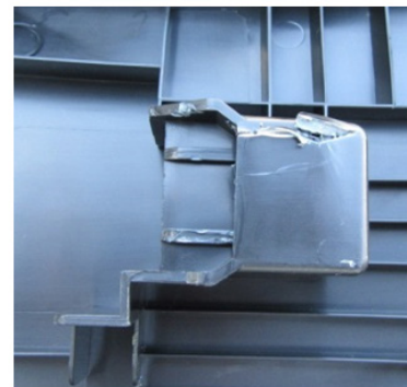
Enlarged View of Damaged Claw