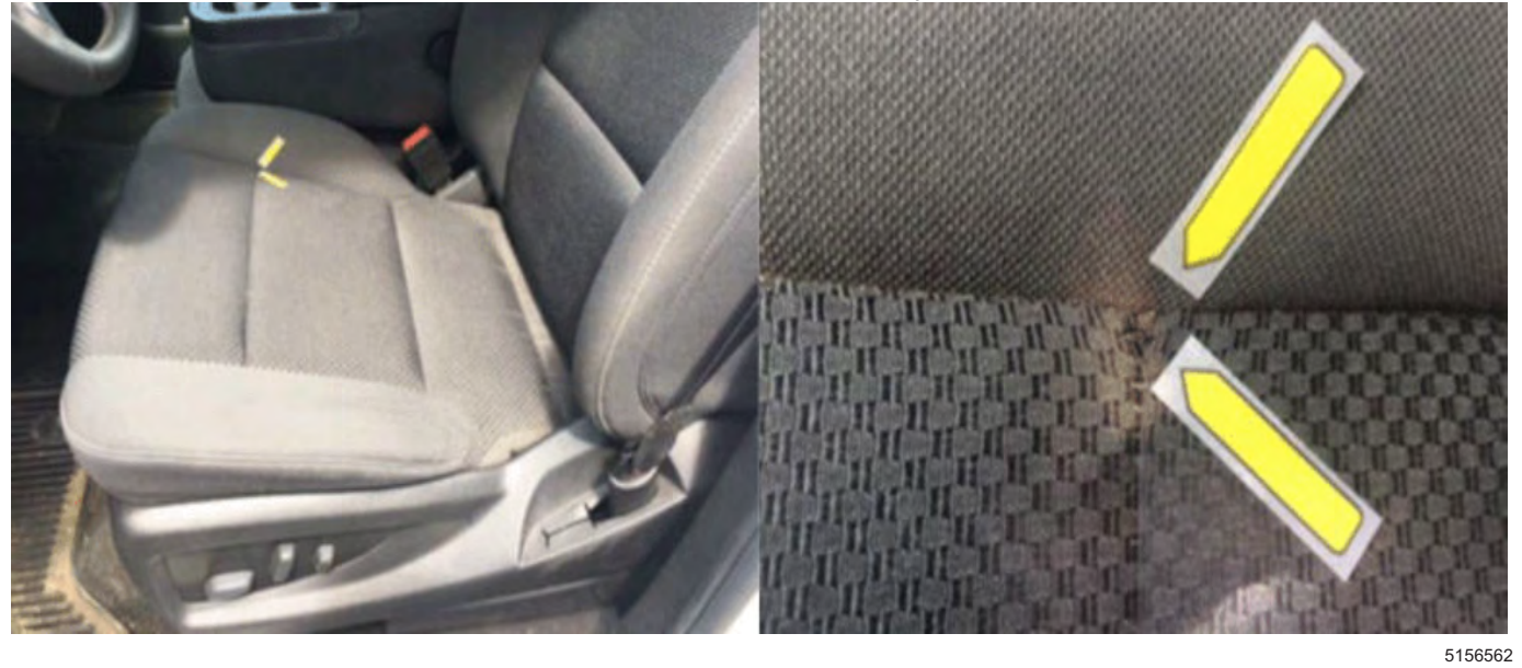
This pointed to where the concern was, which makes it easy to view and see the customer's concern.