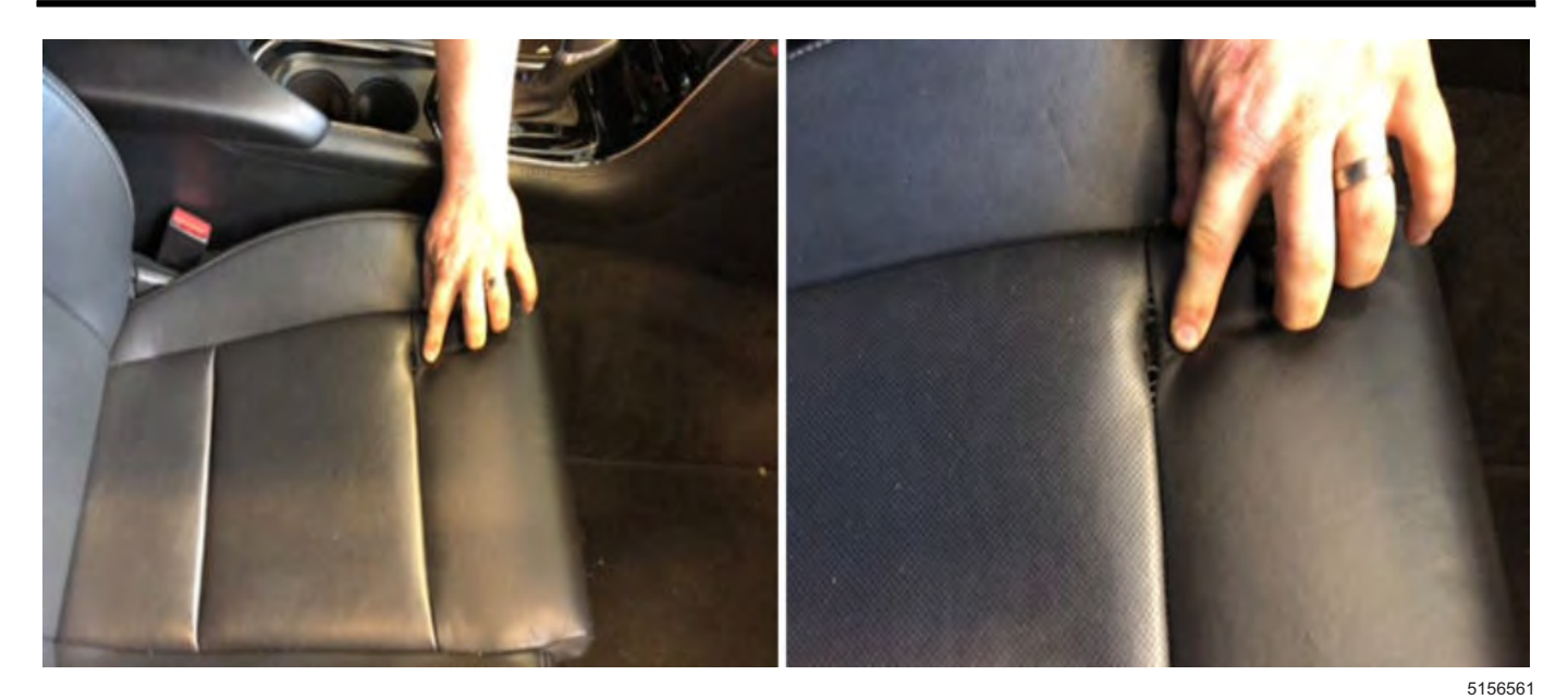
This dealer showed a full view of the seat bottom and a close up of the customer's concern.