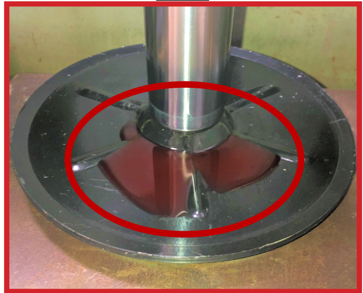
Pooled fluid on footpad.