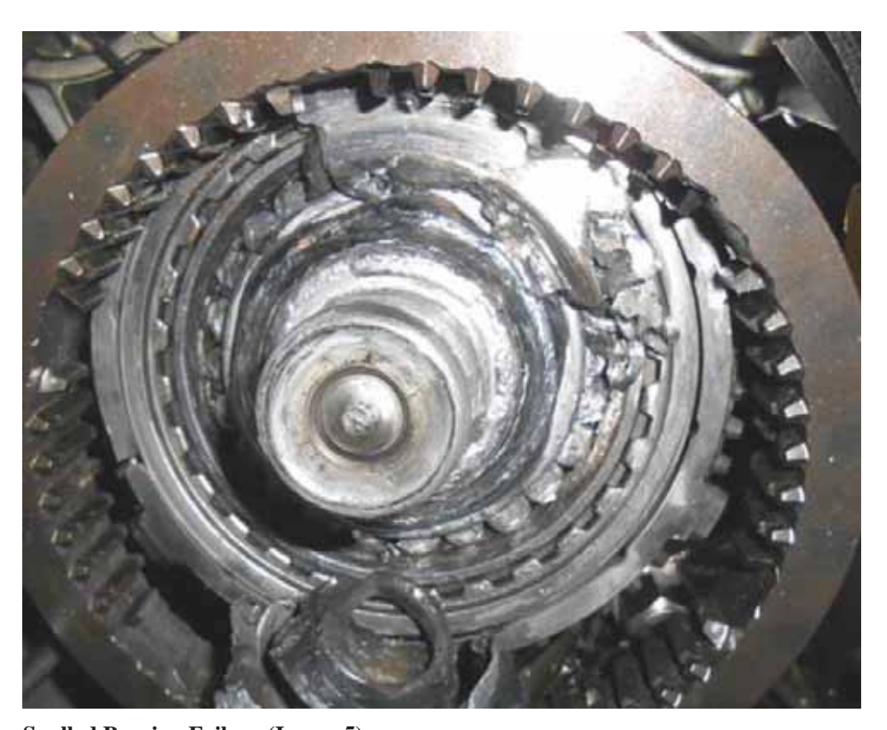
Spalled Bearing Failure (Image 5)

Reviewing DTC readout can be helpful in determining spalled vs. towing damaged spigot bearing. Main shaft speed codes prior to any towing event can indicate that the loss of main shaft pre-load may have begun before the truck was towed to the shop. This means that the bearing started to spall before the unit was towed improperly.