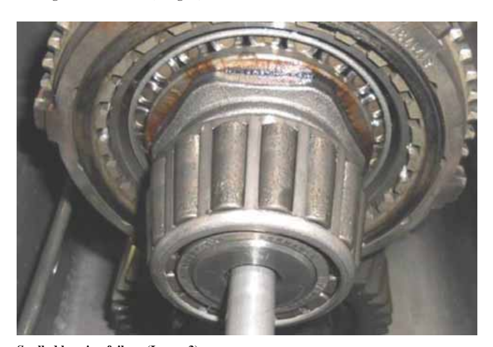
Spalled bearing failure (Image 3)