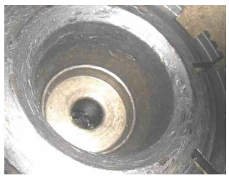
Spalled Bearing Race (Image 6)

These images (5 & 6) represent a failure that went ignored for some time.