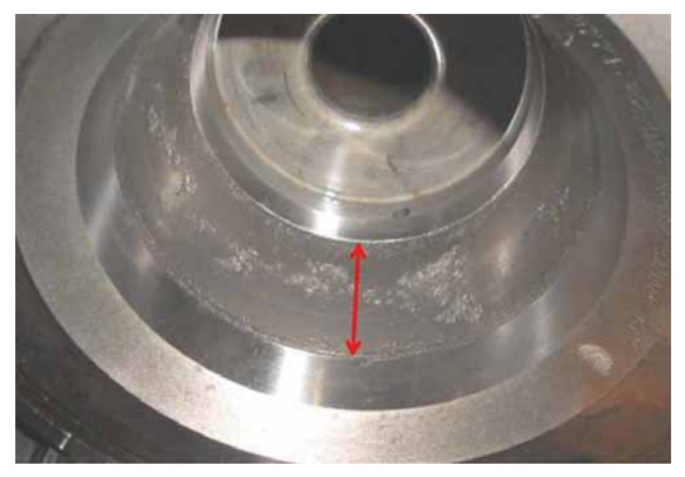
Spalled bearing race (Image 4)