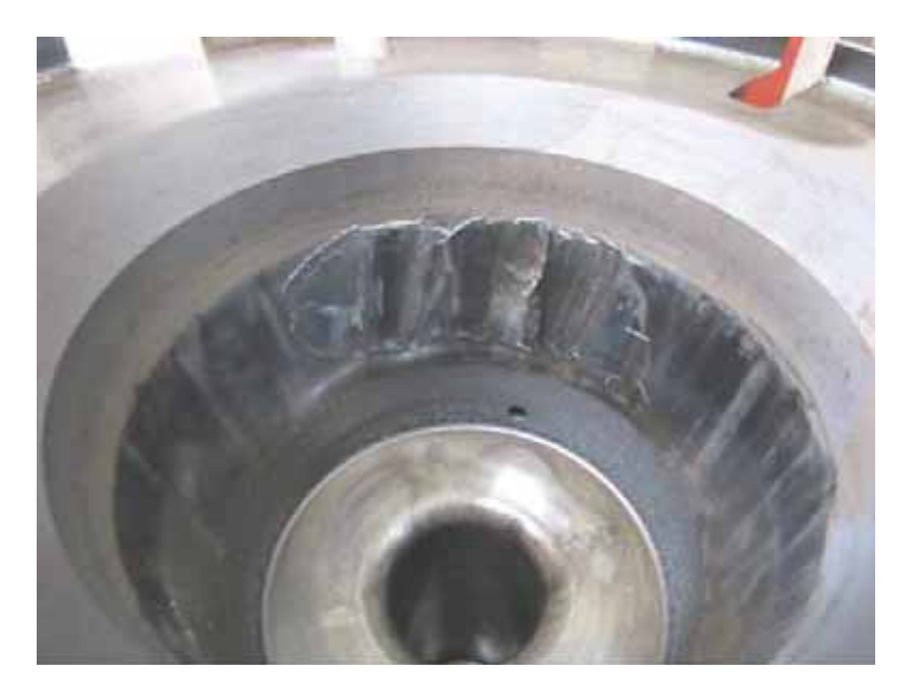
Towing Related Failure (Image 2)