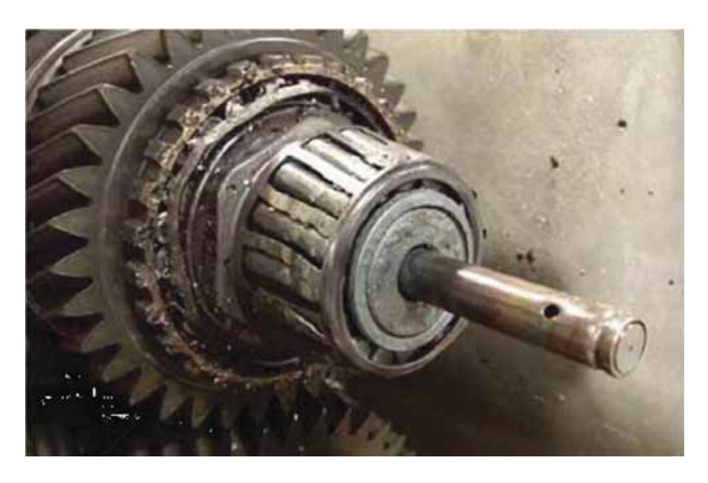
Towing Related Failure (Image 1)