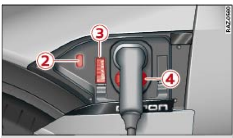
Fig. 90 Charging unit: charging port and LED (example)