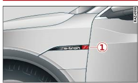
Fig. 89 Opening the charging unit cover (example: left side of the vehicle)