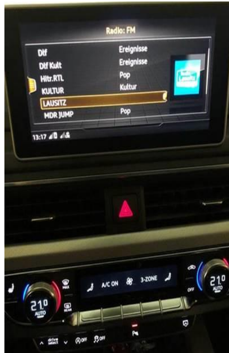
Figure 1. Previously adjusted menu stays the same (vehicles with camera software < 0318).