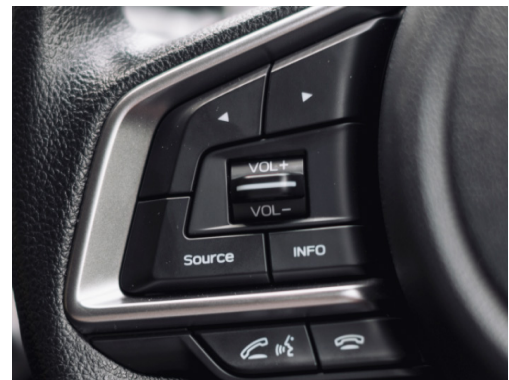
(Image to the right shows steering wheel controls for 2017 Impreza. Design will vary by vehicle line.)