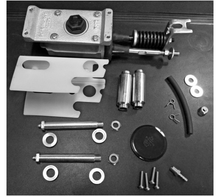
Hose, hose clamps & brass fitting is included only in the "Disc Brake Kit".