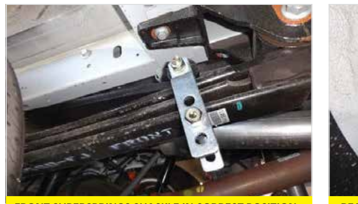
FRONT SUPERSPRINGS SHACKLE IN CORRECT POSITION