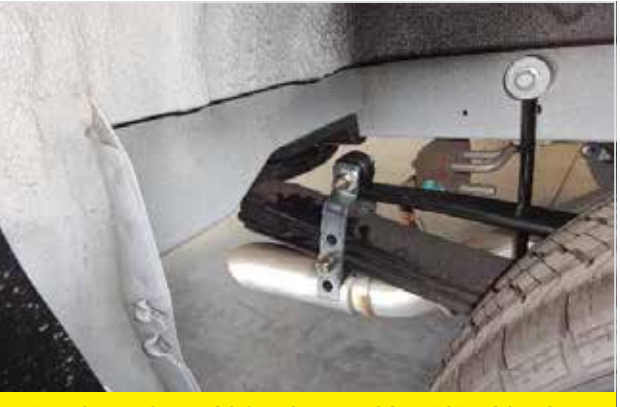
REAR SUPERSPRINGS SHACKLE IN CORRECT POSITION