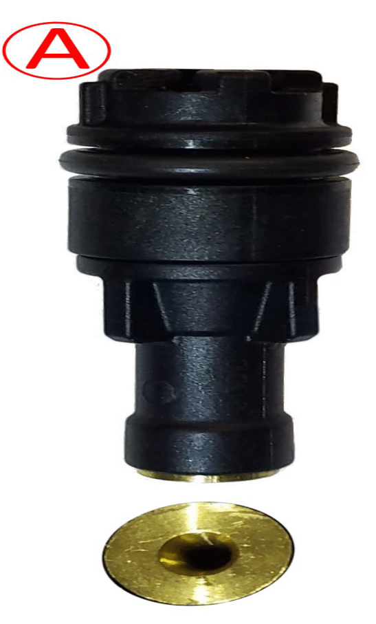
Note: The graphic above compares the old style primary PCV valve (A) to the revised PCV valve (B).