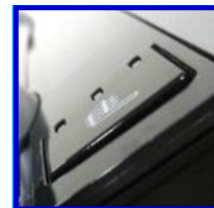
Switch in normal “flush” position