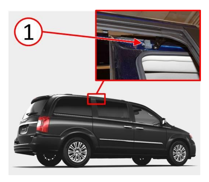
Fig. 1 Remove Bumper

3. Open the rear sliding door and remove the rubber bumper (Fig. 1) from the rear end of the upper door track, then close the door.