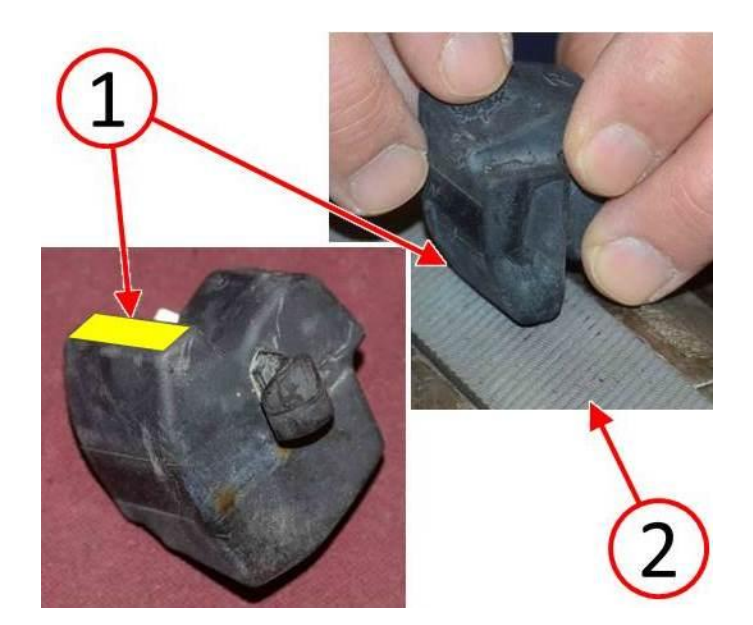
Fig. 2 Modify Bumper