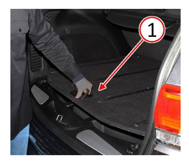
Fig. 1 Remove Cargo Compartment Load Floor Panel