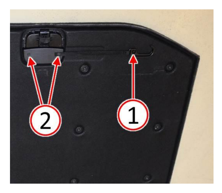
Fig. 2 Remove Screws And Tether With Hook