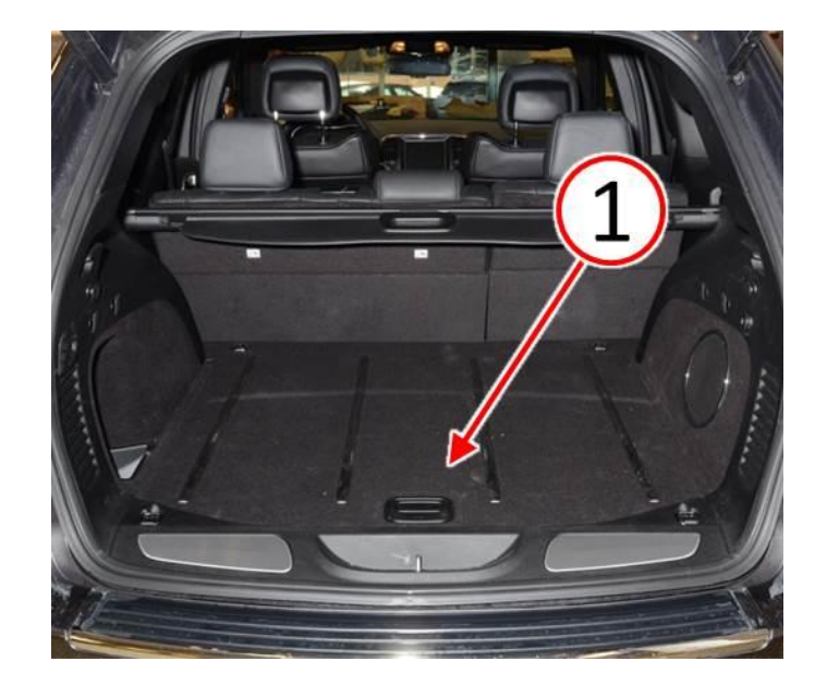
Fig. 7 Install Cargo Compartment Load Floor Panel

11. Install the cargo compartment load floor panel (1) to the vehicle (Fig. 7).