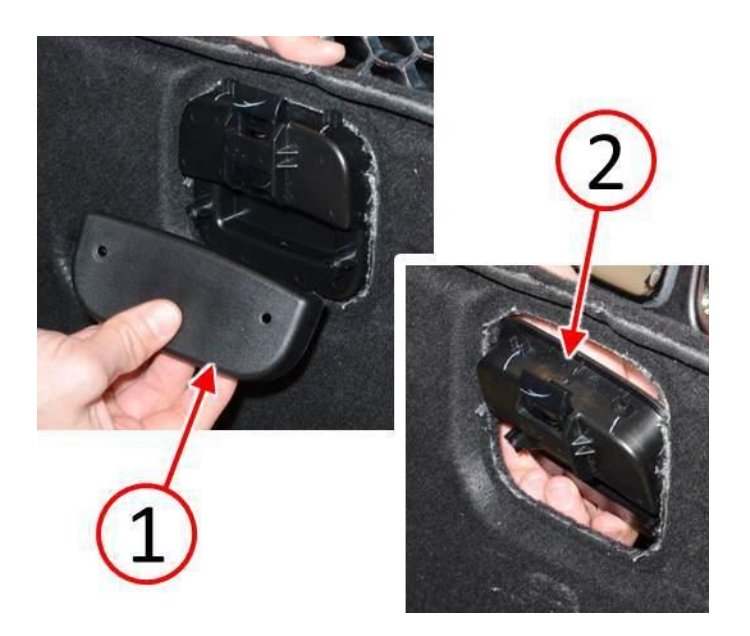
Fig. 3 Remove Latch Handle