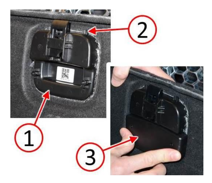
Fig. 5 Install Latch Handle