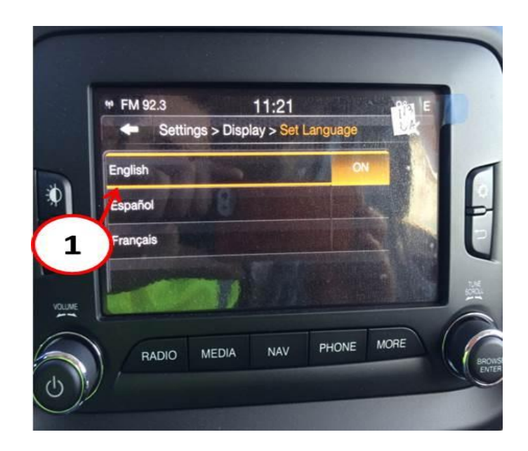
Fig. 17 Select English