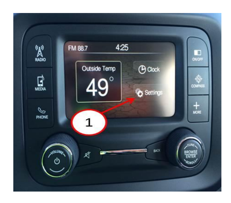
Fig. 7 Select Settings