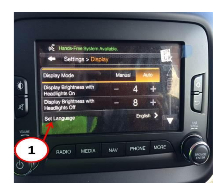
Fig. 15 Select Set Language