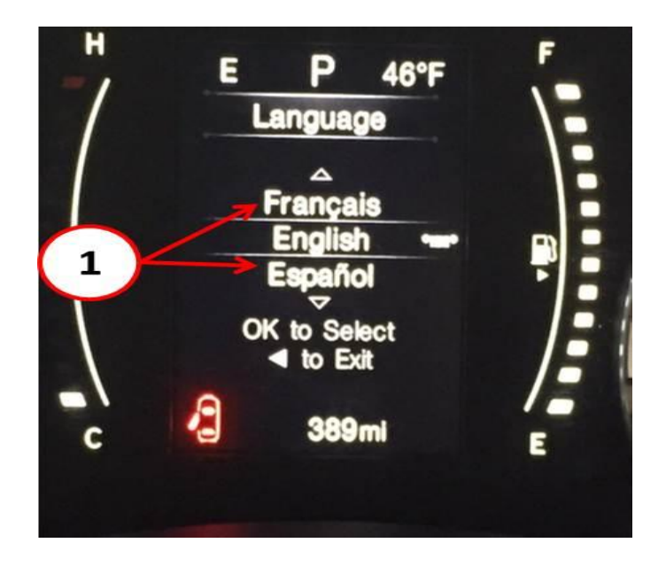
Fig. 4 Select Either French or Spanish

5. First select French or Spanish, before selecting English.