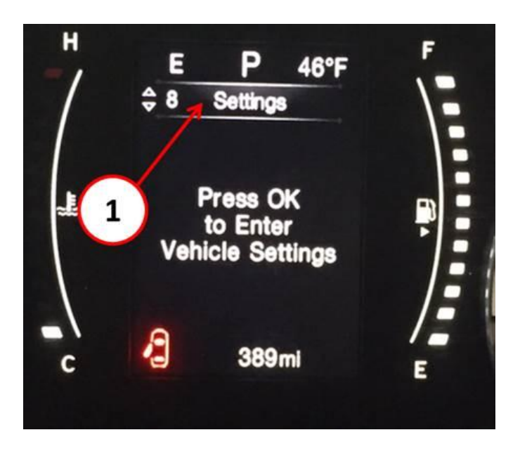
Fig. 1 Select Menu 8