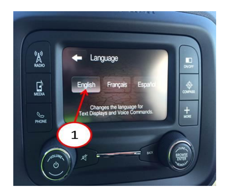
Fig. 11 Select English