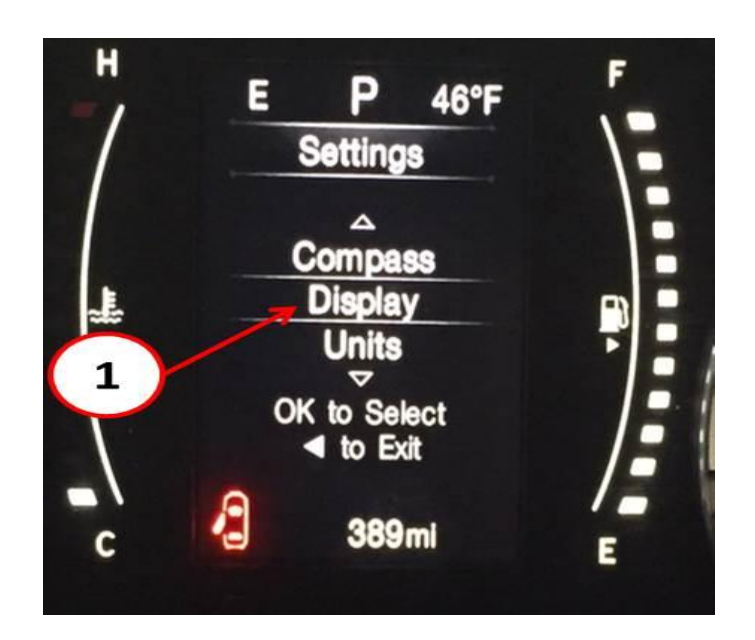
Fig. 2 Select Display