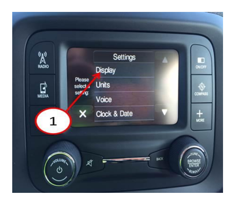
Fig. 8 Select Display