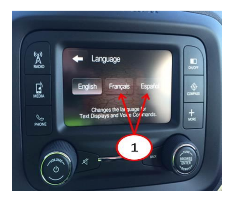
Fig. 10 Select Either French or Spanish

12. First select French or Spanish, before selecting English.