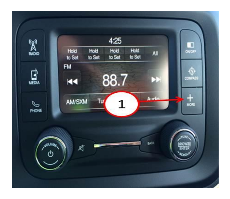
Fig. 6 Press Hard Key More