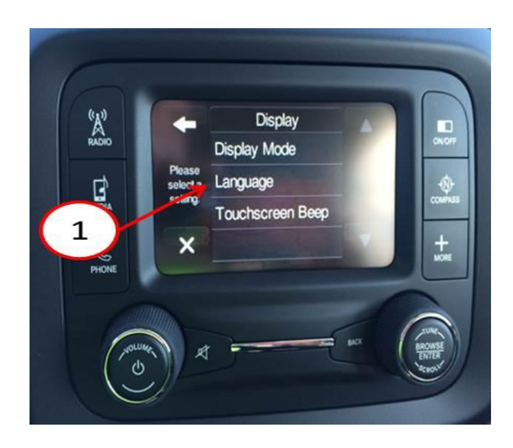
Fig. 9 Select Language