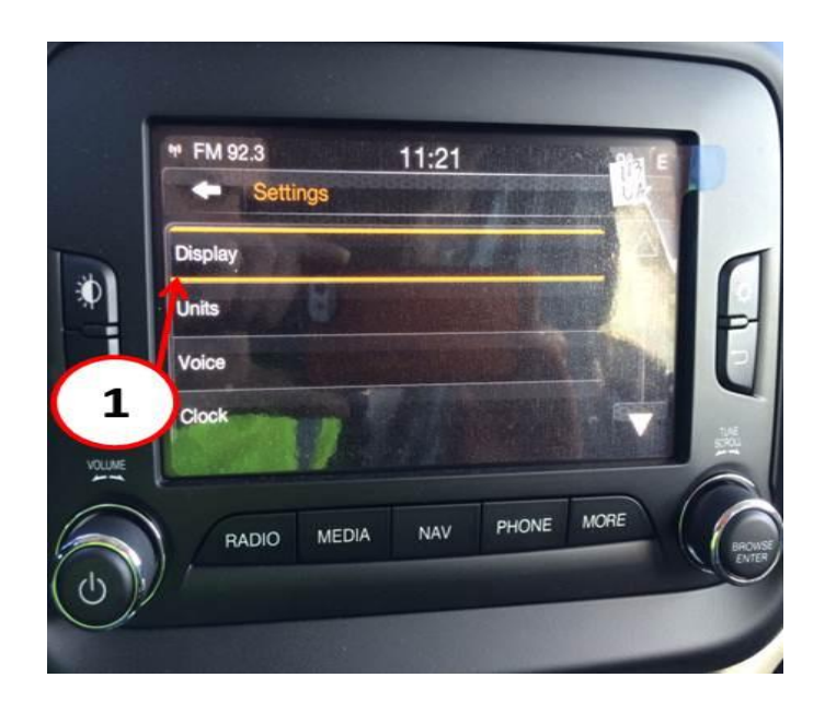
Fig. 13 Select Display