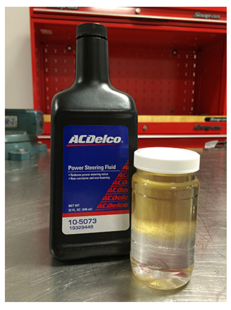
Diesel Exhaust Fluid (DEF) mixed with Power Steering Fluid.