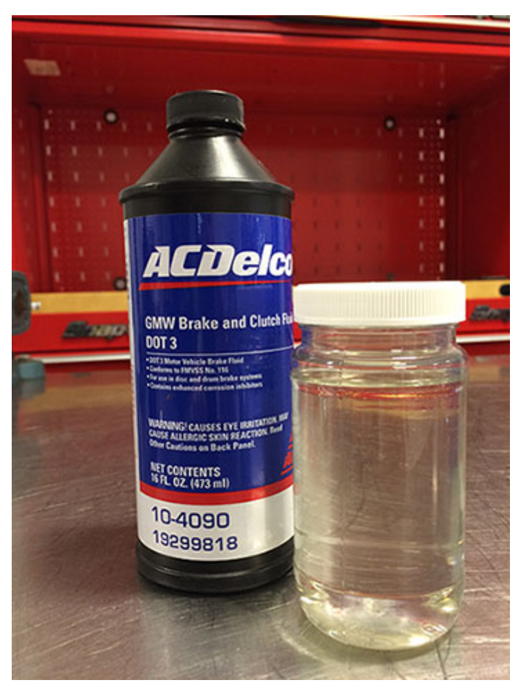
Diesel Exhaust Fluid (DEF) mixed with Brake Fluid.