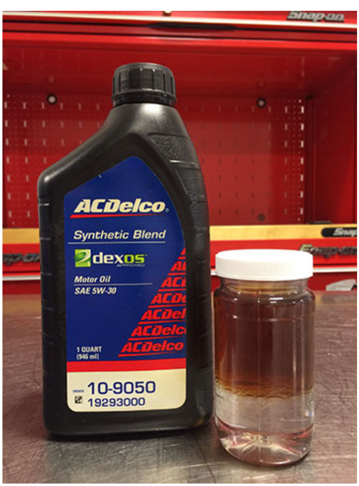
Diesel Exhaust Fluid (DEF) mixed with Engine Oil.