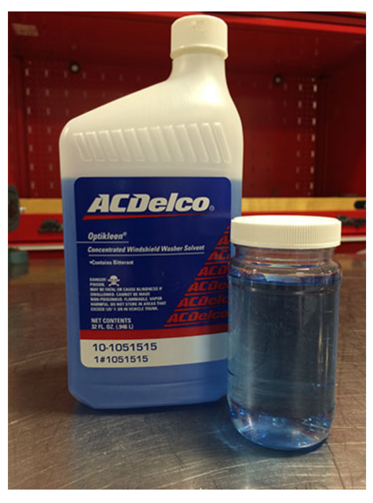
Diesel Exhaust Fluid (DEF) mixed with Windshield Washer Fluid.