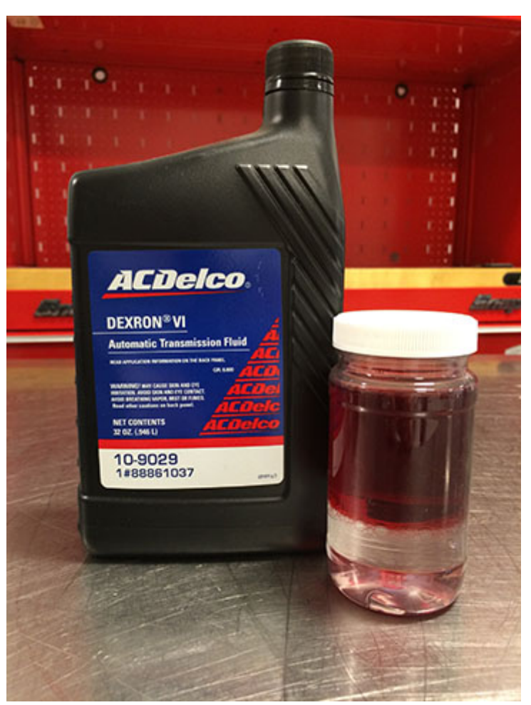
Diesel Exhaust Fluid (DEF) mixed with Transmission Fluid.