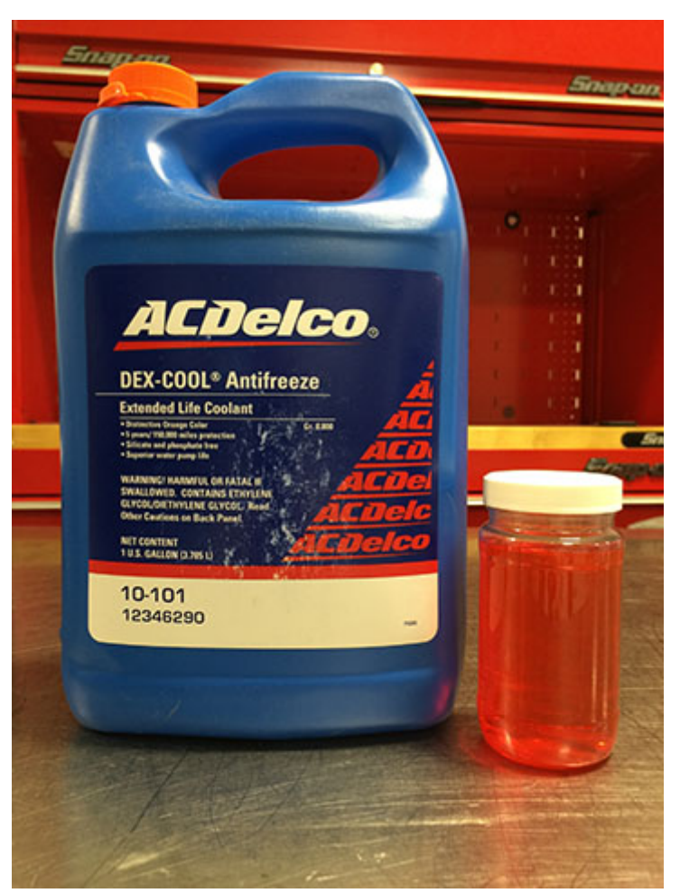
Diesel Exhaust Fluid (DEF) mixed with Dexcool.