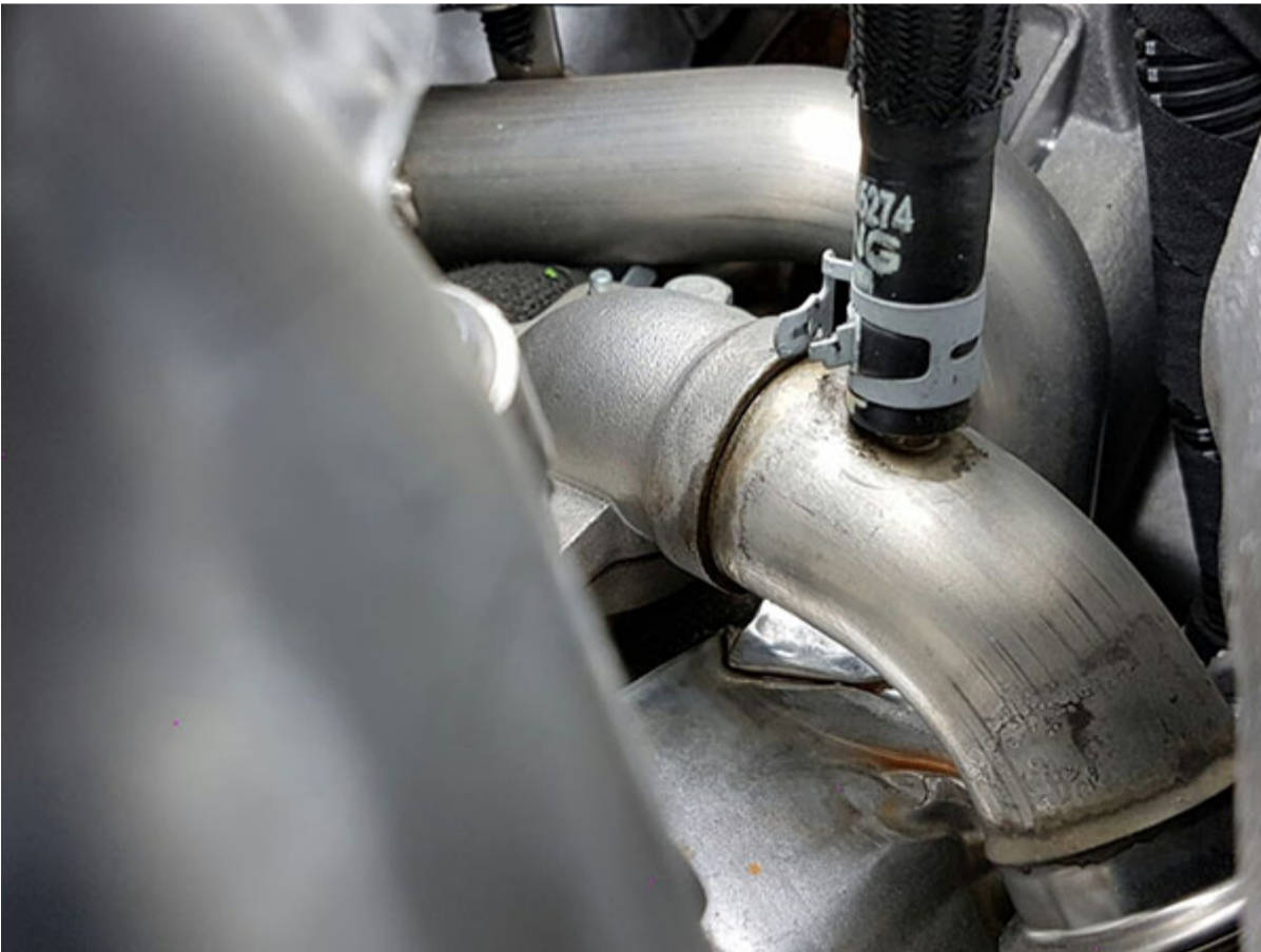
Another view of the leaking welded flange on the Exhaust Gas Recirculation (EGR) coolant feed pipe. Refer to call out #2 in the above picture.