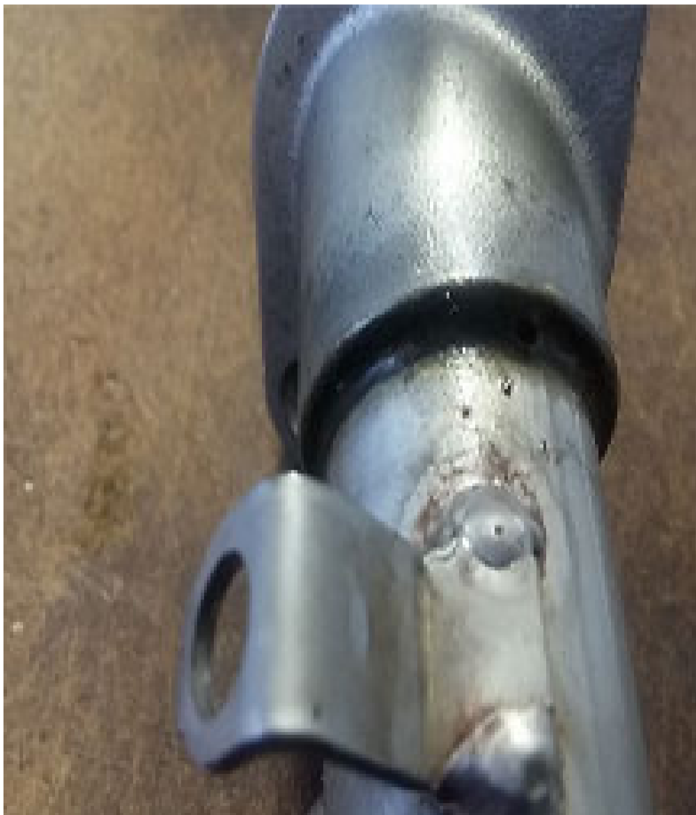
Welded flange leaking on the Exhaust Gas Recirculation (EGR) coolant return pipe. Refer to call out #1 in the above picture.