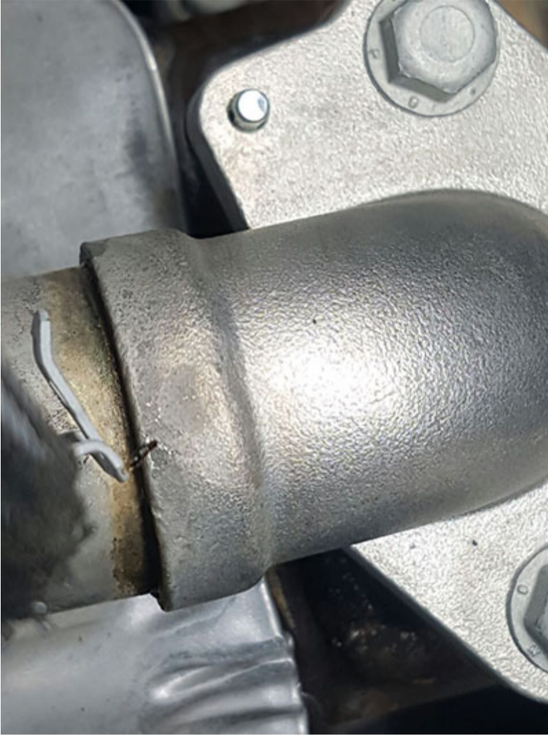
Welded flange leaking on the Exhaust Gas Recirculation (EGR) coolant feed pipe. Refer to call out #2 in the above picture.