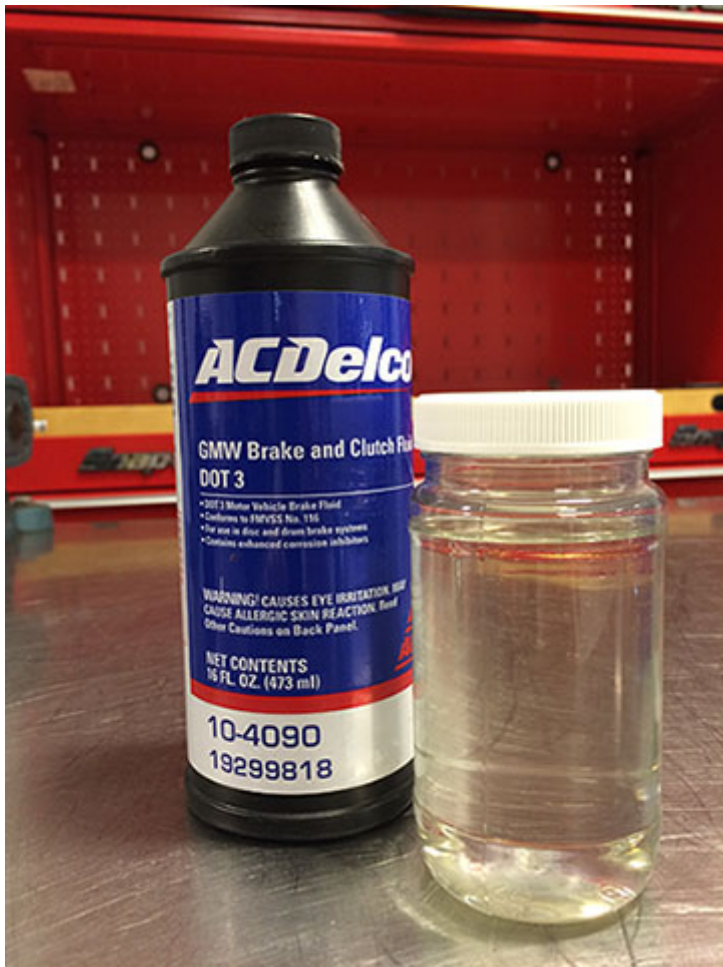
Diesel Exhaust Fluid (DEF) mixed with Brake Fluid.