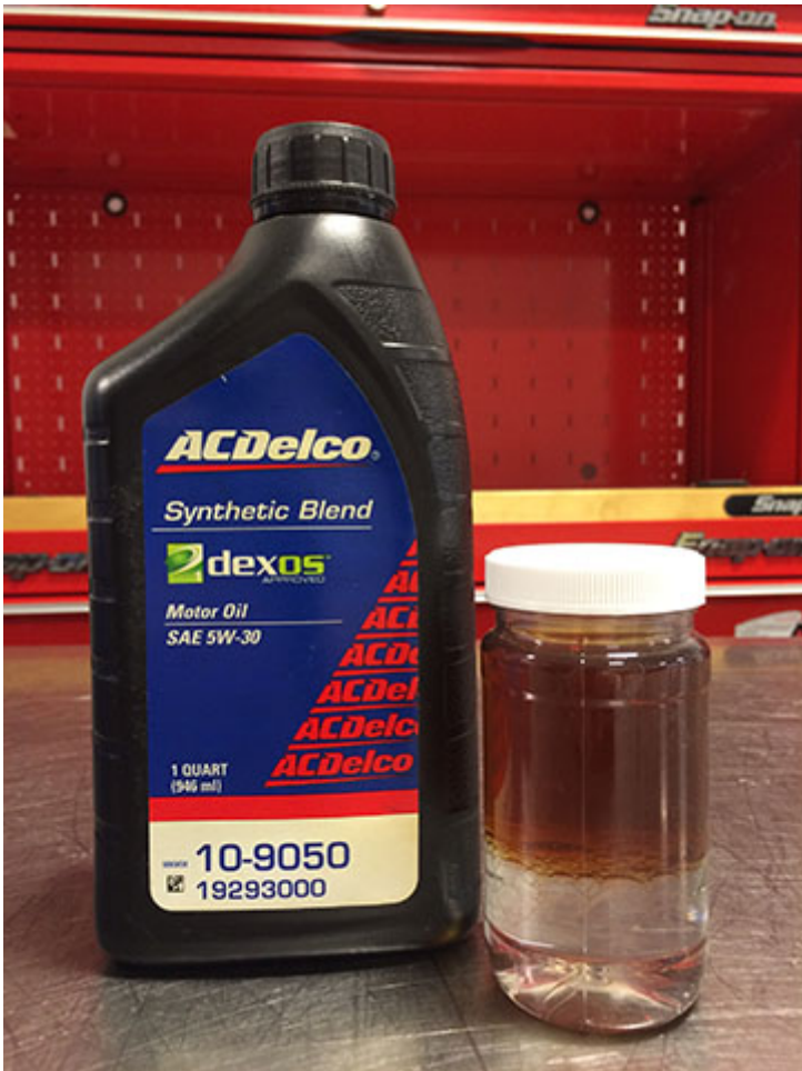
Diesel Exhaust Fluid (DEF) mixed with Engine Oil.