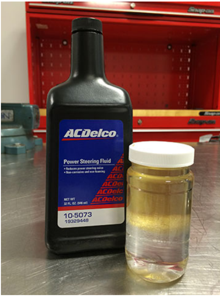
Diesel Exhaust Fluid (DEF) mixed with Power Steering Fluid.