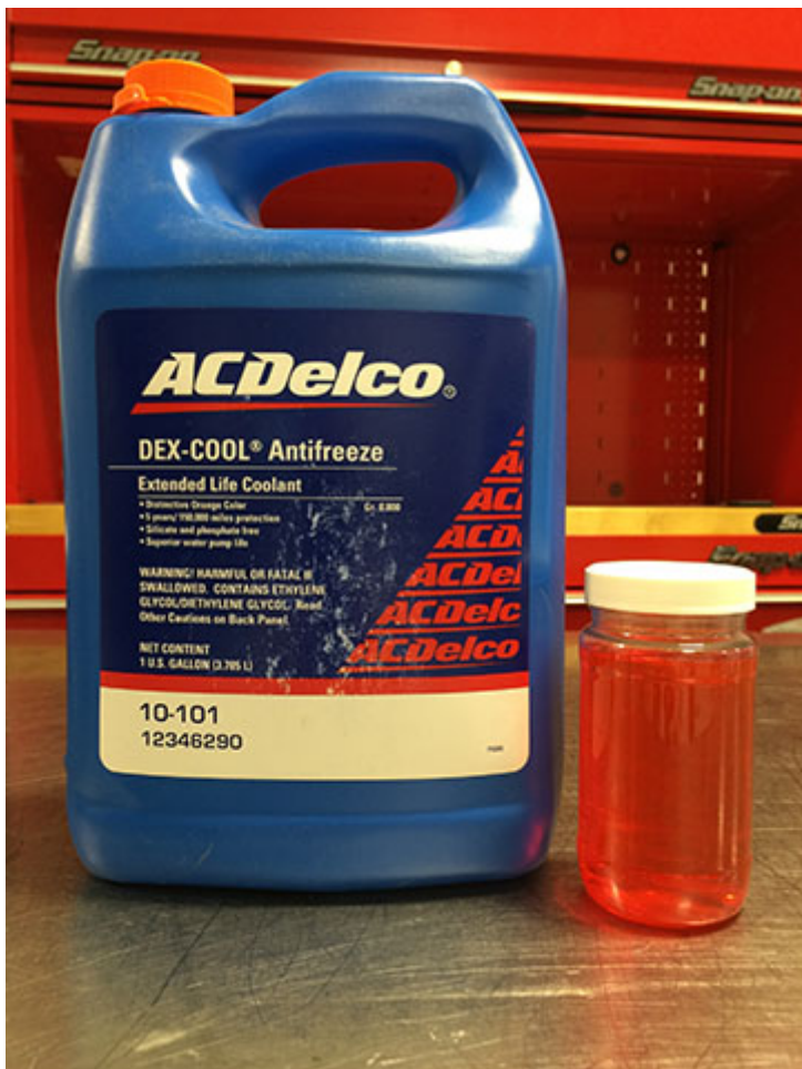
Diesel Exhaust Fluid (DEF) mixed with Dexcool.