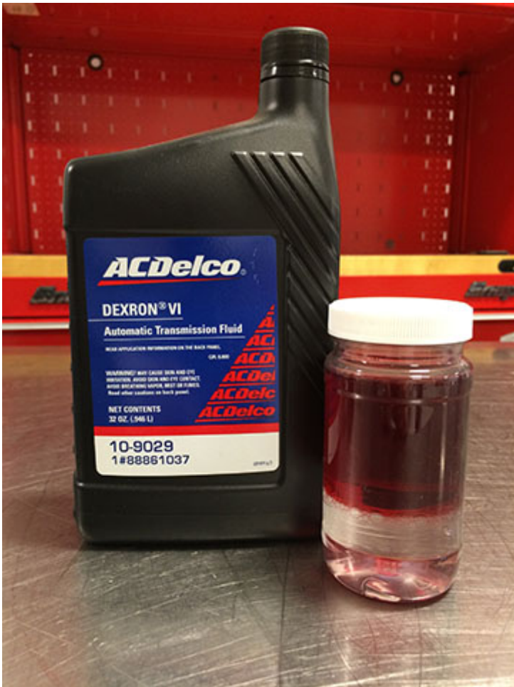
Diesel Exhaust Fluid (DEF) mixed with Transmission Fluid.