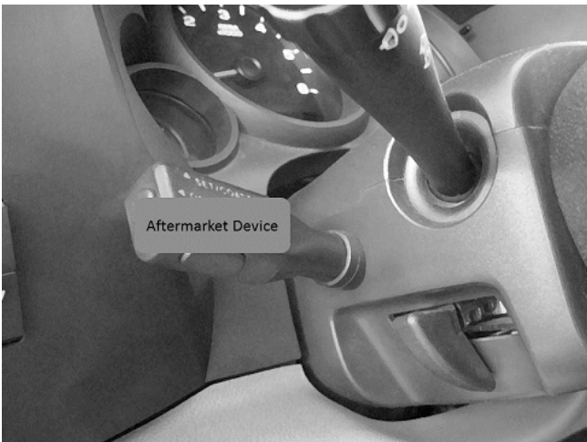
Monitoring Device Example