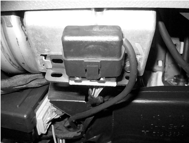
Aftermarket Device Switch