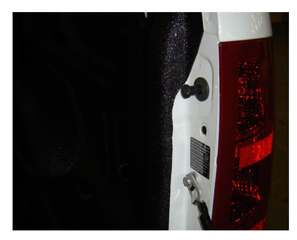
Tailgate opening view