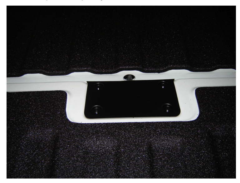
Bed floor (with rear camera access panel, gate open)