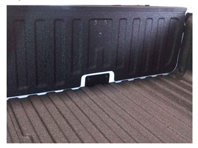
Tailgate with Rear Vision Camera (gate in closed position)