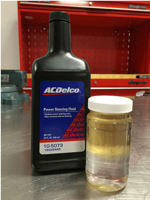
Diesel Exhaust Fluid (DEF) mixed with Power Steering Fluid.