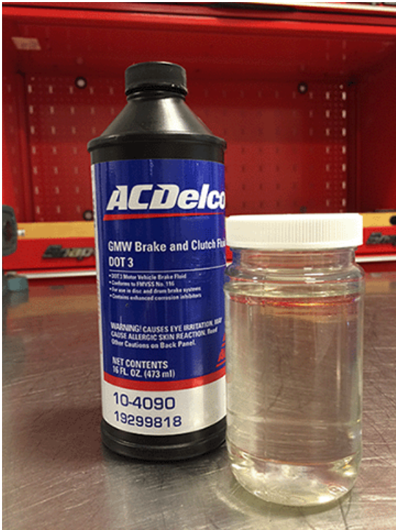
Diesel Exhaust Fluid (DEF) mixed with Brake Fluid.