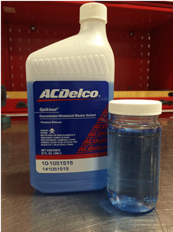
Diesel Exhaust Fluid (DEF) mixed with Windshield Washer Fluid.