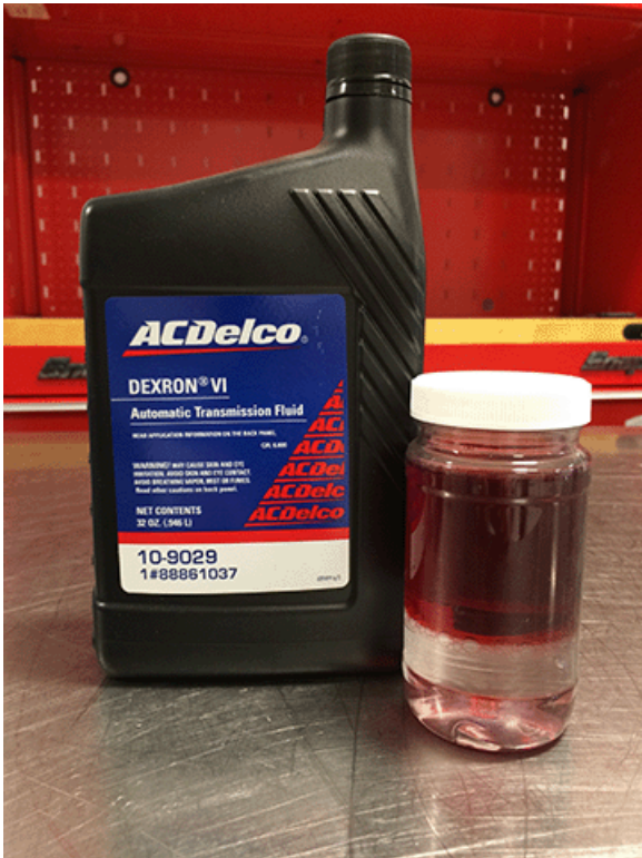
Diesel Exhaust Fluid (DEF) mixed with Transmission Fluid.