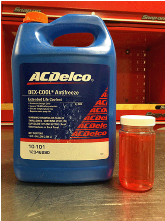
Diesel Exhaust Fluid (DEF) mixed with Dexcool.