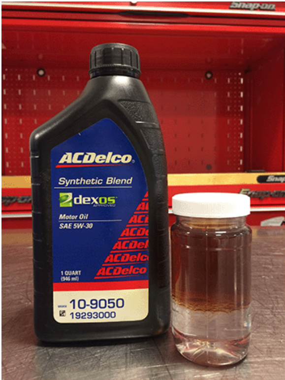
Diesel Exhaust Fluid (DEF) mixed with Engine Oil.