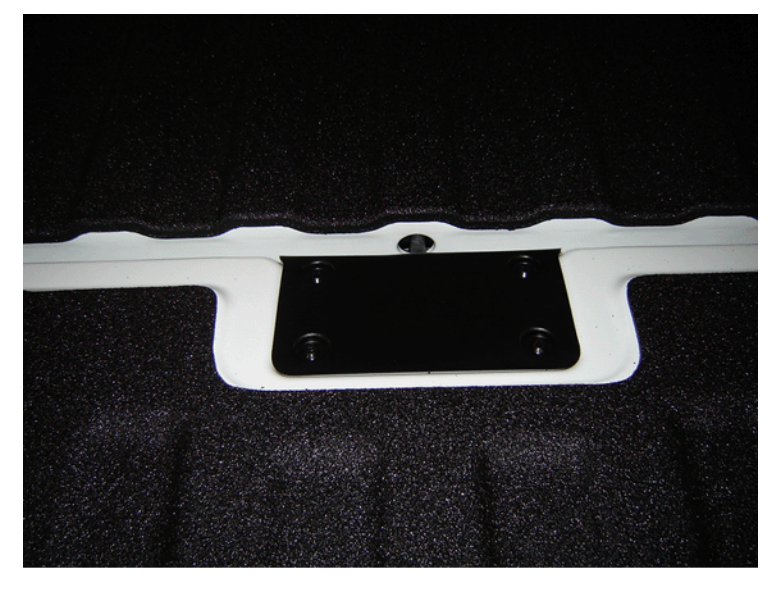
Bed floor (with rear camera access panel, gate open)