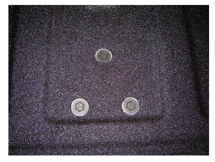
Tailgate handle bolts