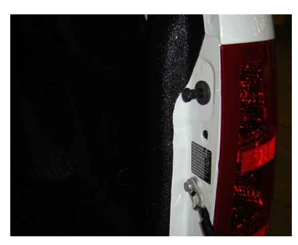
Tailgate opening view