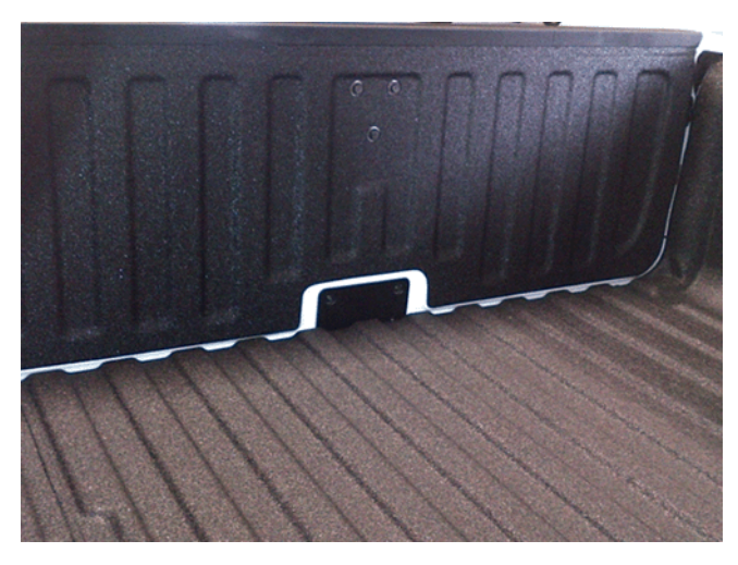
Tailgate with Rear Vision Camera (gate in closed position)