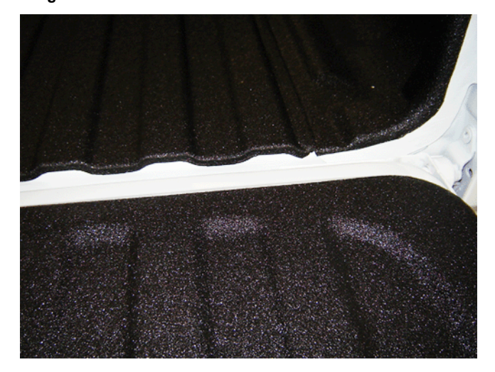
Lower tailgate and bed floor