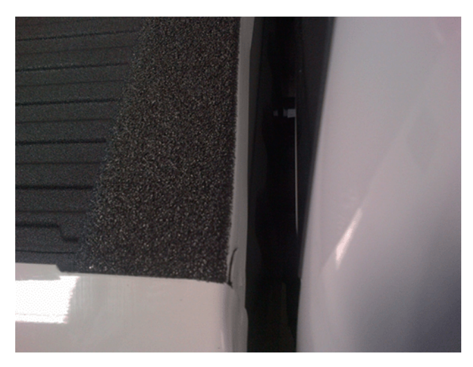
Bed header panel close up