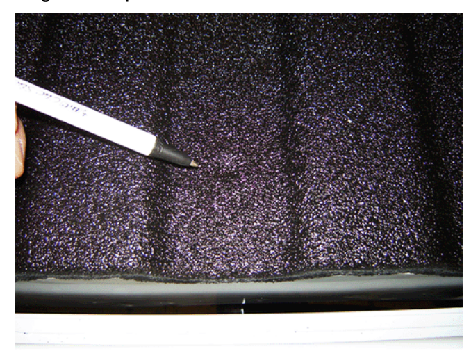
Spot weld under bed liner example