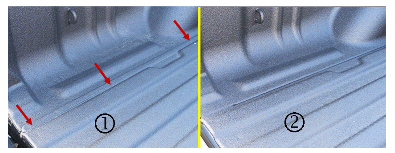
Important: ONLY for vehicles receiving the spray-in bed liner (RPO CGN), a production change was implemented at the three full size truck plants which eliminated the application of seam sealer and basecoat to the pickup bed floor. The change was implemented at Fort Wayne Assembly in April 2015, and at the Silao and Flint plants in May 2015. Examples of the different appearance are shown in the graphic above. Vehicles built prior to the change (1) will have a wide bead of seam sealer visible, whereas those built after (2) will not. The difference is cosmetic appearance only, and the integrity of the spray-in liner is the same for both applications.

Because the bed liner material is sprayed on evenly, any variation in the bed such as seam sealer or spot welds in the sheet metal will show underneath the spray on coating. This is an expected condition. The coating does not completely fill in these variations.