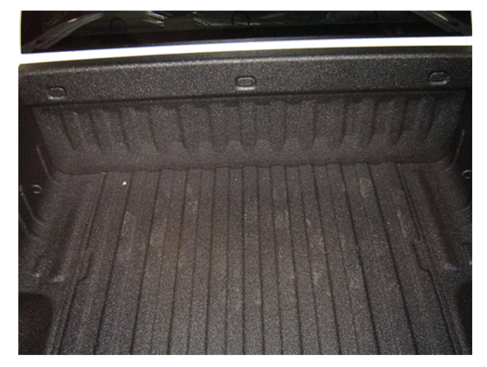
Bed header panel