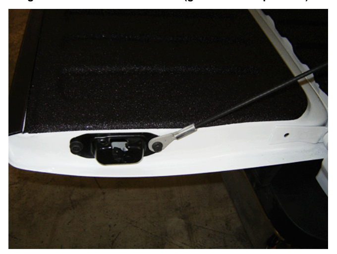
Tailgate side view