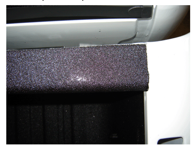
Bed header panel/side panel joint