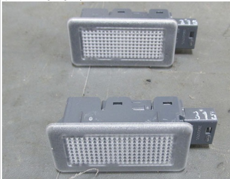
3) Light up Accent Lighting on the door panels AND Footwell Lighting

IMPORTANT: When installing a GM Accessory Lighting Kit, the light strips around the radio display and the center cupholders will NOT illuminate. The only way to get these two lights to operate is to purchase the vehicle with the factory C70 RPO. The radio display and the center cupholder will NOT illuminate with installation of the GM Accessory Lighting Kit.