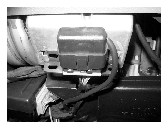
Aftermarket Device Switch