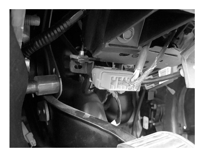
Fleet Tracking Module Plugged Into the DLC