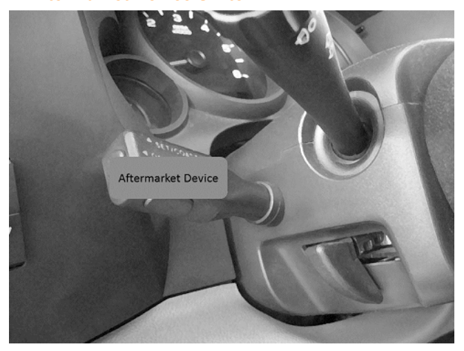
Monitoring Device Example