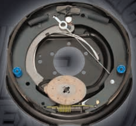
12" x 2"