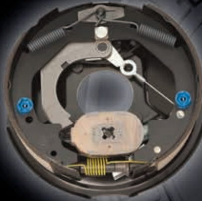
10" x 2¼"