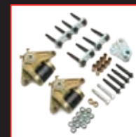
Complete E-Z Flex® Suspension Kit