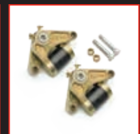
E-Z Flex® Equalizer & Bolts Kit