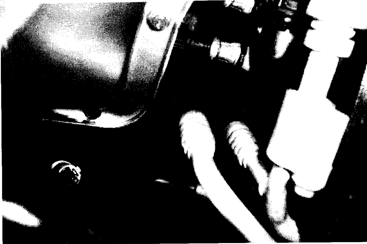
Picture taken from under the CVT Gearbox oil pan