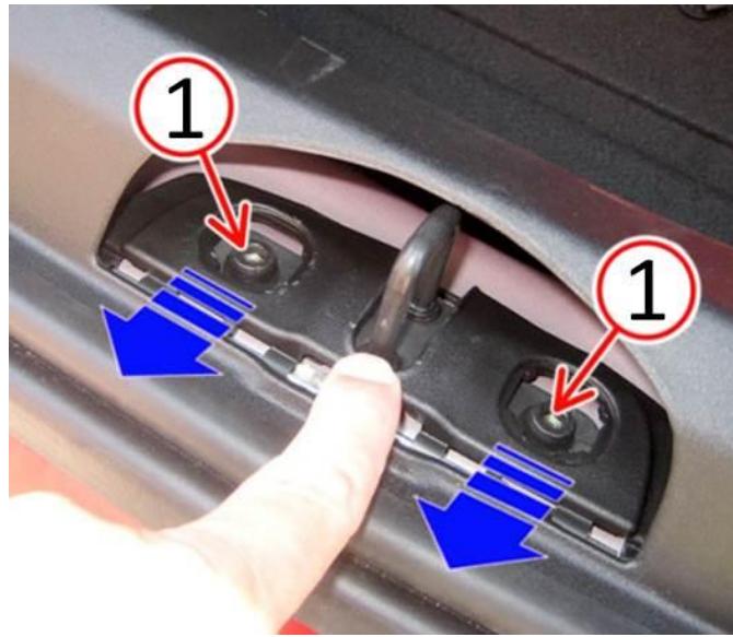
Fig. 5 Liftgate Striker Adjustment