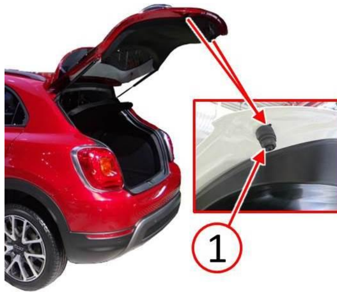
Fig. 2 Liftgate Bumpers