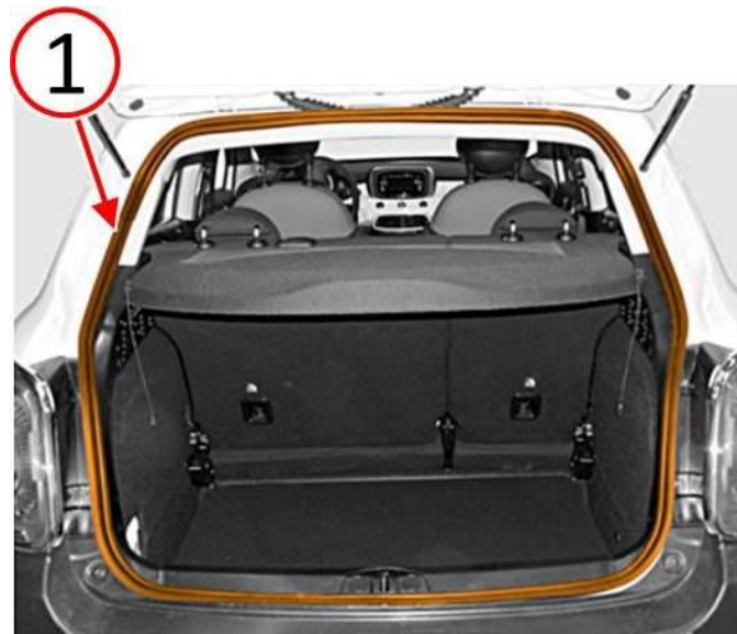
Fig. 3 Liftgate Weatherstrip