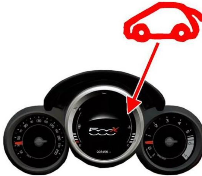
Fig. 1 Liftgate Open Indicator