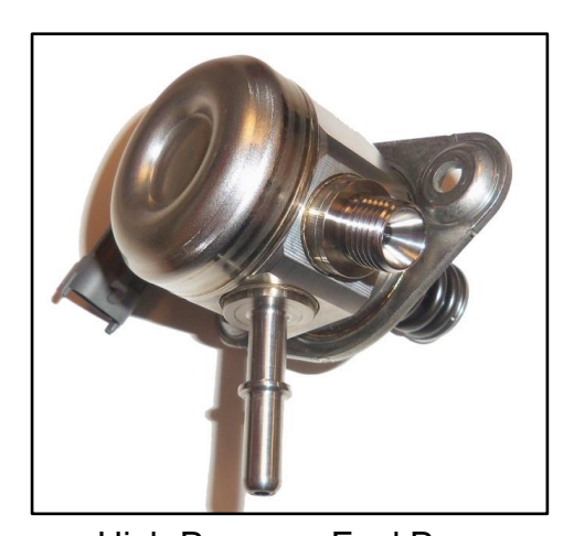
High Pressure Fuel Pump

DTC P0087 - Fuel Rail Pressure (FRP) Too Low