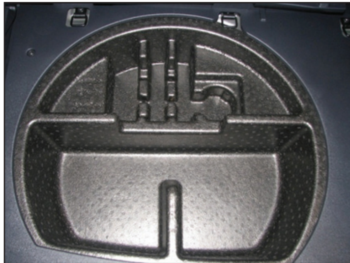
New Luggage Tray Assembly

This bulletin provides information relating to the missing luggage tray assembly in some 2013MY Rio vehicles produced from June 11, 2012 to September 6, 2012. To correct this issue, installation of the Luggage Tray Assembly Kit will be required for all affected units. Kia is requesting the completion of this Service Action on all affected Rio vehicles in dealer stock prior to delivery. Before conducting the procedure, verify that the vehicle is included in the list of affected VINs.